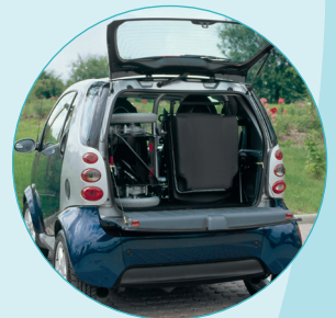
A200 in a car