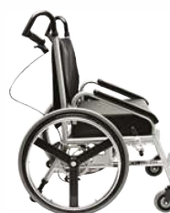
Sport armrests, side view