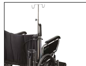
IV holder and O2 holder