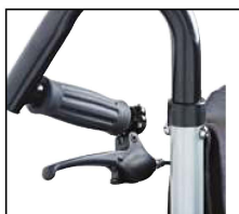
Hand brake operated by attendant