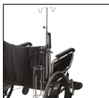
IV holder and O2 holder