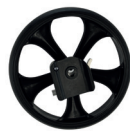
SPEED REDUCTION WHEELS