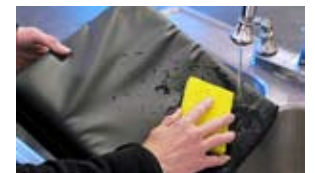
Easy washing and cleaning