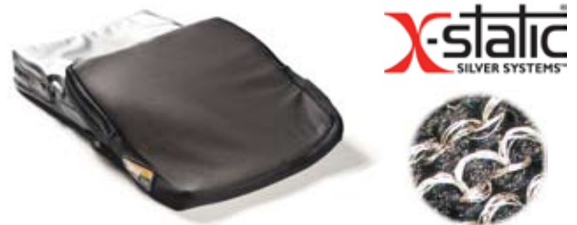
Outer and inner cover