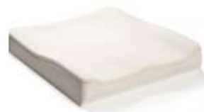
Dual layered contoured foam base