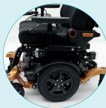
Mid wheel drive option