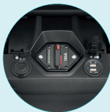
External charging socket with USB