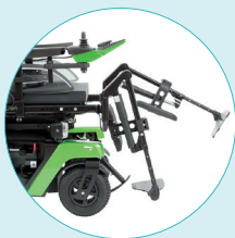
Elevating leg rest