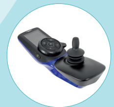
Ten degree controller