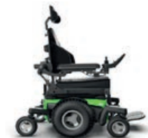
Magic 360 Off-Road