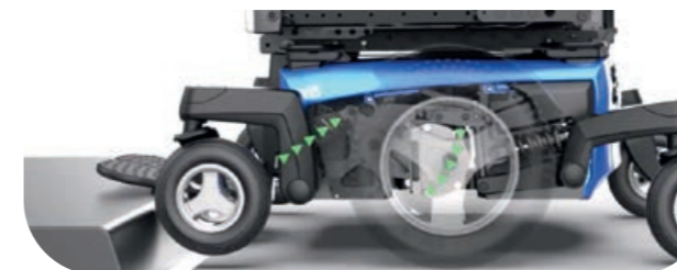
Step 1: The castor arm raises and forces the drive wheel into the ground, maximising traction

Designed to get you where you need to go as comfortably and easily as possible. Adjustable coiled springs sit on each castor arm to dampen every bump in the road and as they all articulate independently, as one climbs over an obstacle the other three keep the chair level and stable. Even at slow speeds!