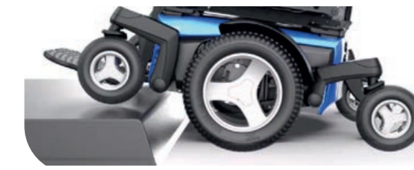
Step 3: The chair rocks onto the rear castor with the front castor elevated, allowing obstacle climbing