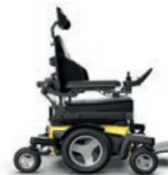
Magic 360 Urban