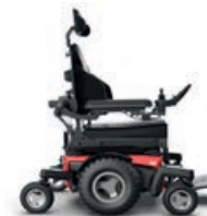
Magic 360 Crossover