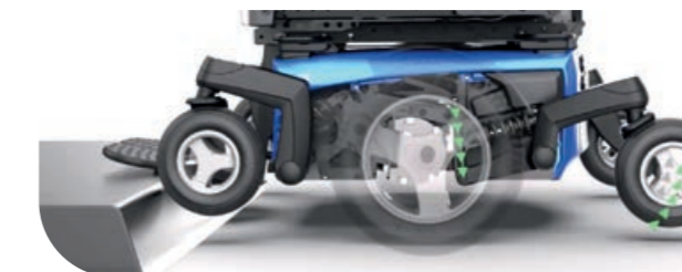
Step 2: As the drive wheel is forced down, the rear castor arm is raised up