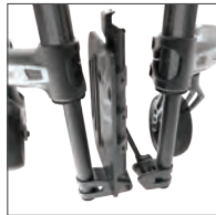
6 AUTO FOLDING FOOTREST Innovative design that allows the footrest to fold at the same time as the wheelchair frame