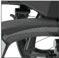
1 RUBBERIZED HAND GRIP To facilitate transfers