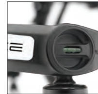
8 BUBBLE LEVELS Highly accurate and calibrated system for a quick and perfect adjustment