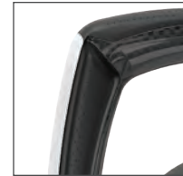
4 INTEGRATED PAD Provides more comfort and avoid pressure points on the knees