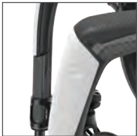
5 INTEGRATED IMPACT GUARD Protects the front frame from wear and tear