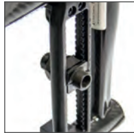
2 INNOVATIVE REAR WHEEL AXLE PLATE Offers micro adjustments while maximizing stability and responsiveness