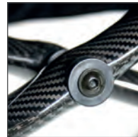
3 ULTRARIGID FOLDING SYSTEM Offers best-in-class propulsion efficiency