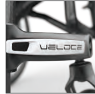
7 FRONT BUMPER Provides style and protection