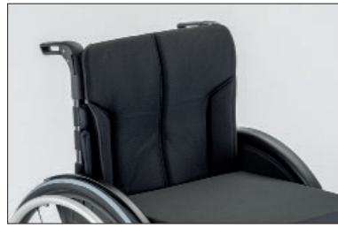
MD03 Back support upholstery, padded