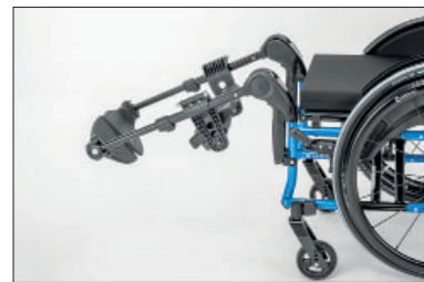
MB25 Leg supports, elevating