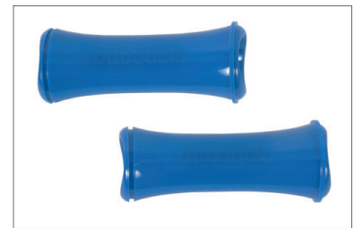
MZ89 Protection for quick-release-axle