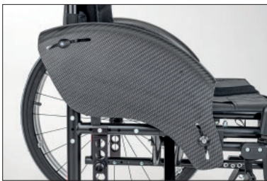
ME04 Carbon side panel