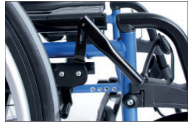
MH10 Knee lever wheel lock extension