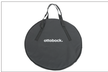
MZ58 Bag for drive wheels