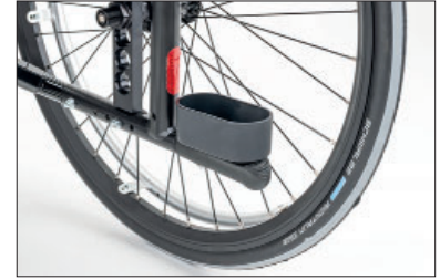
MA57 Crutch holder