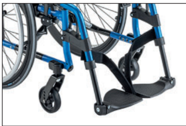
MB10 Leg supprt, individual, angle- adjustable, swivel up