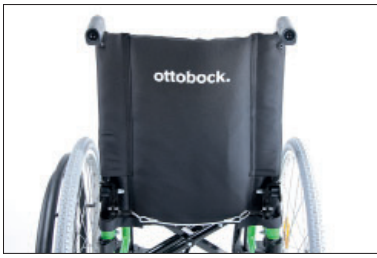
MD04 Back support upholstery Standard