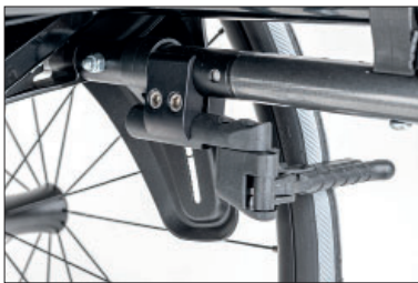
MH05 Outfront-scissor wheel lock