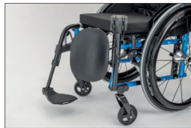
MB22 Amputation leg support, left