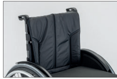
MD05 Back support upholstery, breathable