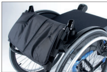
MD11 Foldable back support table