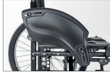
ME02 Side panel with clothing guard and against cold