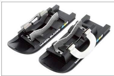
MZ92 Wheel Blades