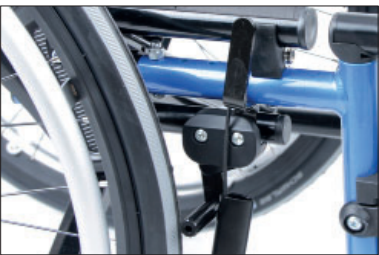
MH01 Knee lever wheel lock