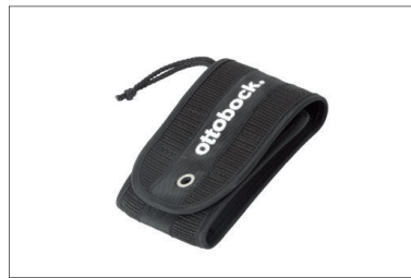
MZ59 Poket for mobile phone