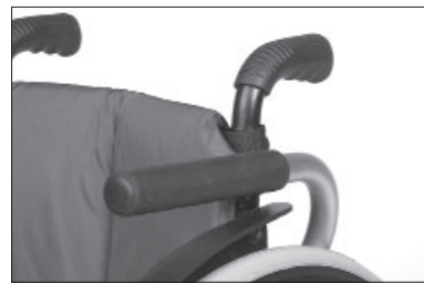
ME50 Side panel, padded