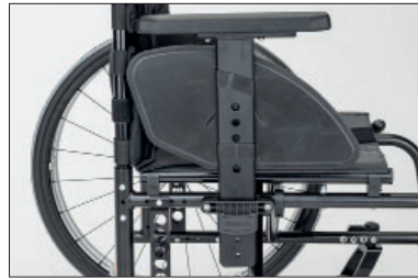
ME11 Plug-on side panel plastic