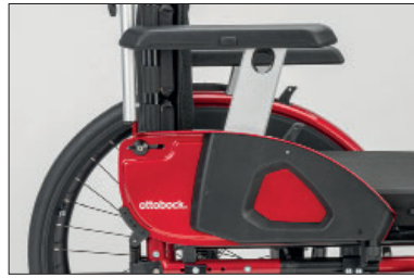
ME17 Side panel with arm support long, height-adjustable