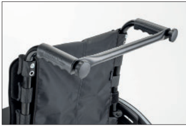
MD58 Stabiliser bar