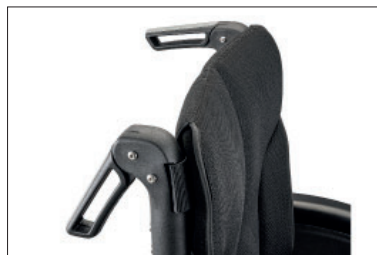
MD56 Push handles foldable