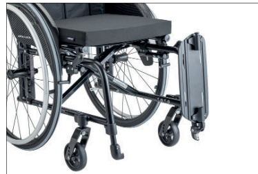
MB201 Foot support bar swing-away, left