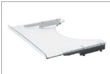
ME60 Therapy tray