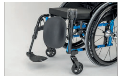
MB22 Amputation leg support, left