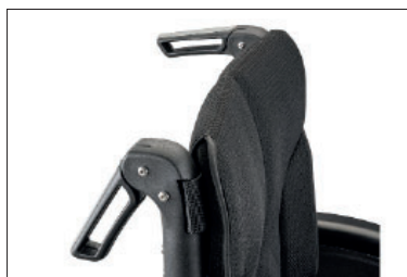
MD56 Push handles foldable