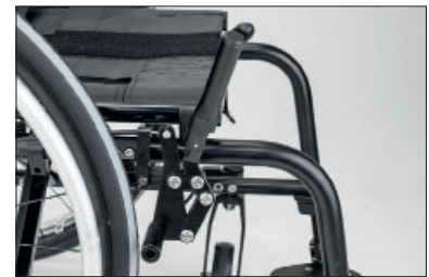
MH08 Knee lever wheel lock for one-hand activated