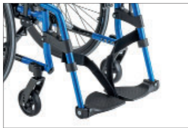
MB10 Leg support, individual, angle-adjustable, flip up