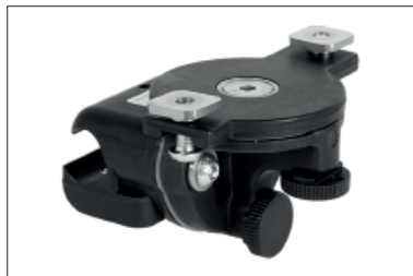
ME61 Elevating swivel unit for fore- arm support