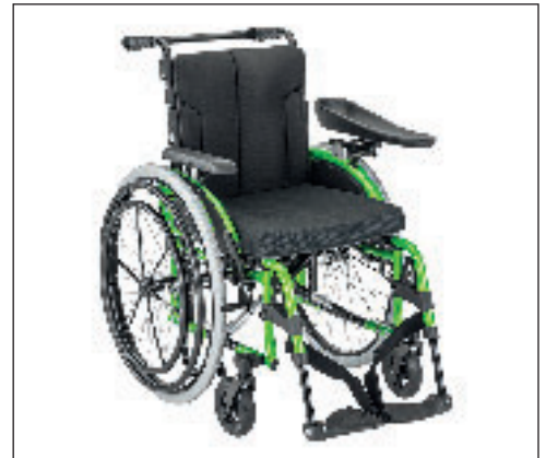
Figure shows additional charge options