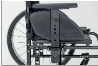
ME11 Plug-on side panel plastic