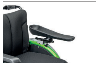
ME70 forearm support, left