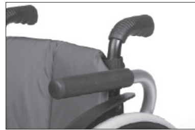
ME50 Side panel, padded