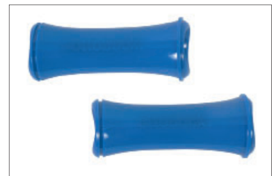
MZ89 Protection for quick-release-axle