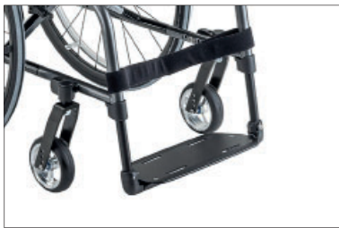
MB03 Single-panel foot plate, angle-adjustable