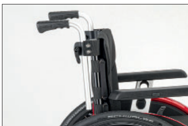
MD55 Push handles heighth-adjustable, removable