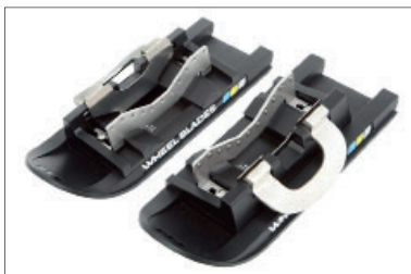
MZ92 Wheel Blades