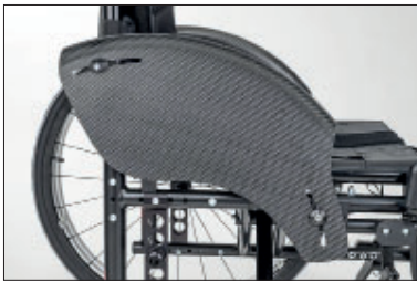
ME04 Carbon side panel