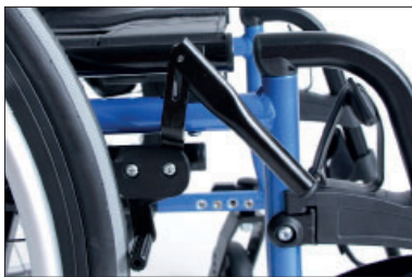
MH10 Knee lever wheel lock extension