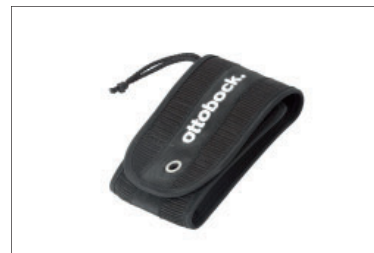
MZ59 Pocket for mobile phone