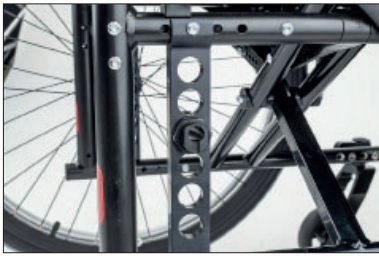
Dirve wheel adapter