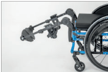
MB25 Leg supports, elevating