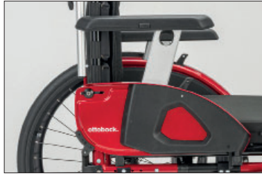
ME17 Side panel with arm support long, height-adjustable