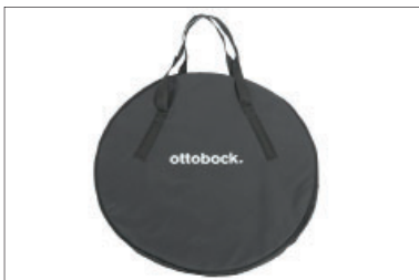
MZ58 Bag for drive wheels