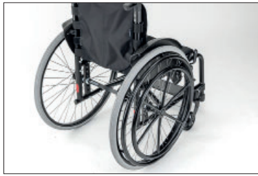
MG83 One-arm drive wheel with double handrim, right