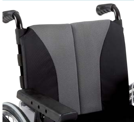
• Silver grey/black