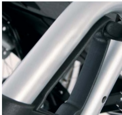
• Silver metallic