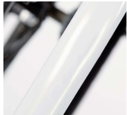
• White pearl