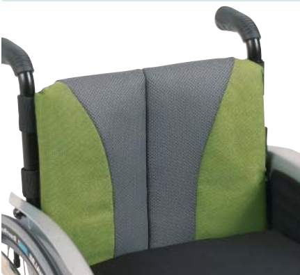
• Silver grey/green