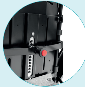
Back recline adjustment