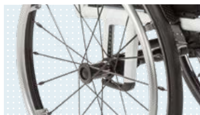
Permanently welded drive wheel connection