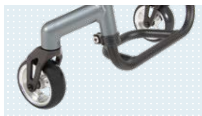
Permanently welded caster wheel connection