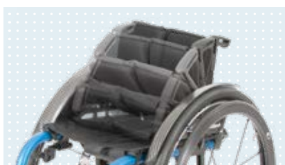
Folding, angle-adjustable back support