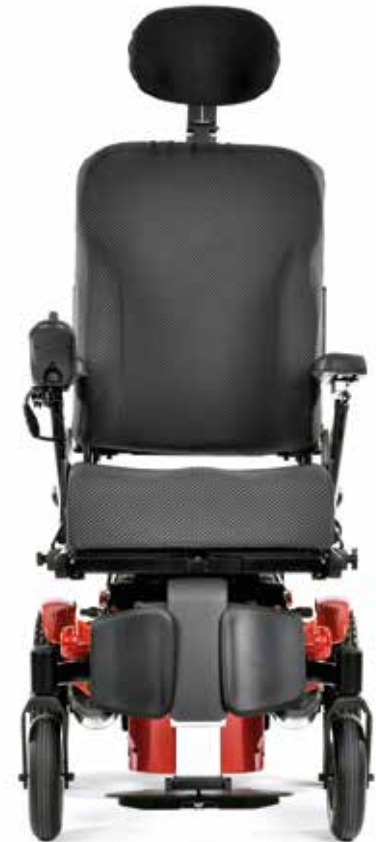
Q300 R MINI