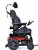
Q300 R Mini