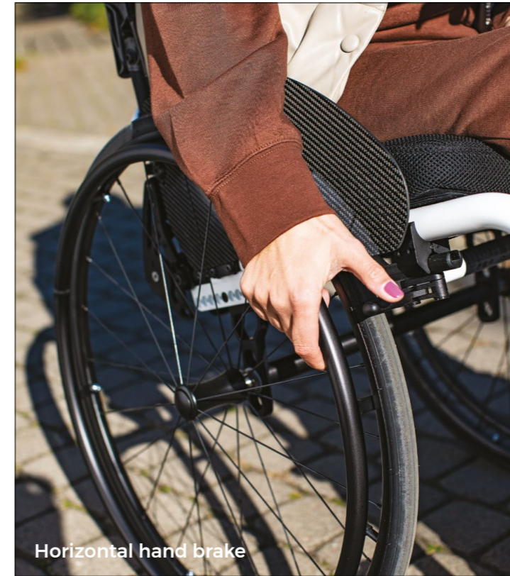
Horizontal hand brake