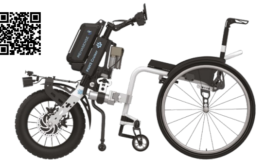
ICON 60 with PAWS