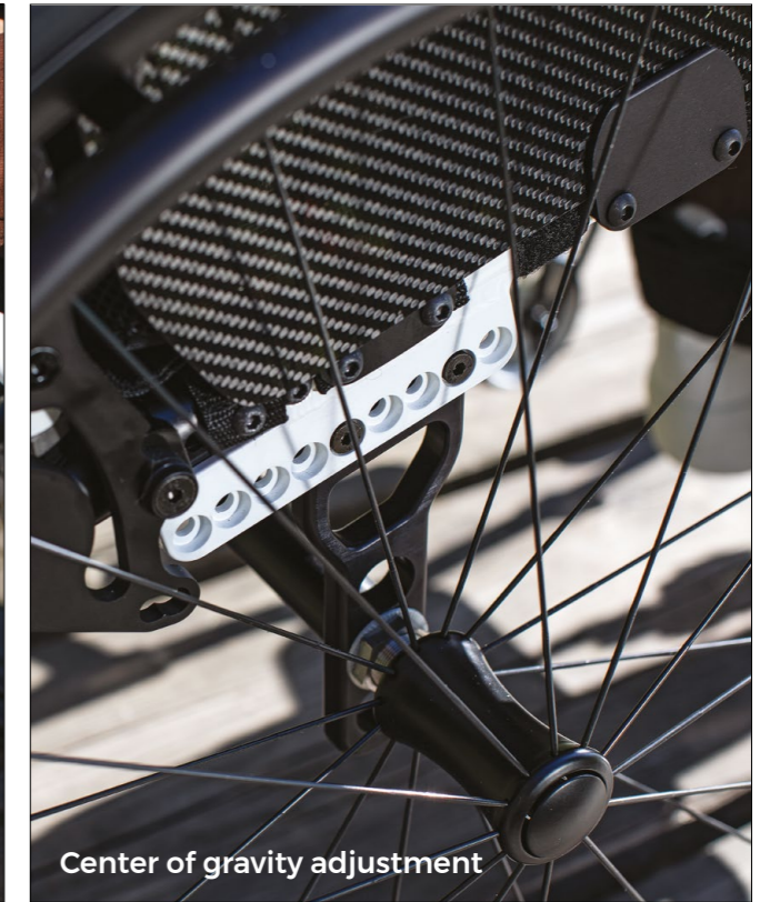
Center of gravity adjustment