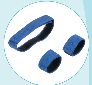
Other accessories available