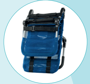
Easy folding for storage