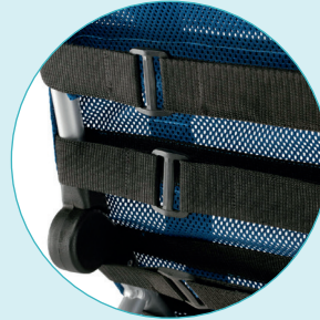
Adjustable straps for comfort