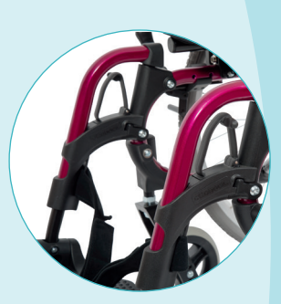
Swing away footrest