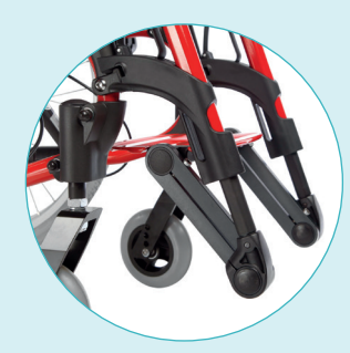
Short lower leg length footplate