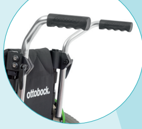
Attendant brake option