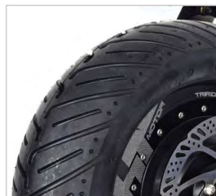
Supermotard Carbon mudguard default