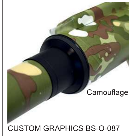
CUSTOM GRAPHICS BS-O-087