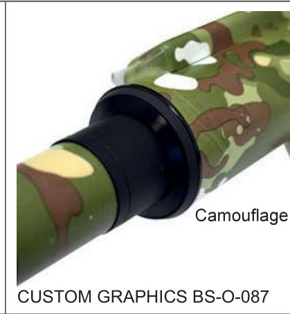
CUSTOM GRAPHICS BS-O-087