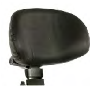
// QZT030430 & QZT030431