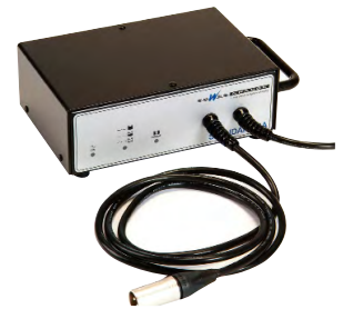
// QZT160103 & QZT160104