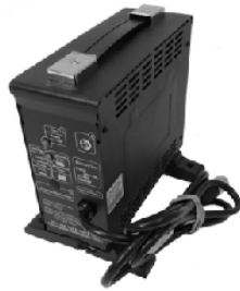
// QZT160100 & QZT160101